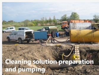
Cleaning solution preparation and pumping