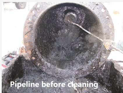
Pipeline before cleaning