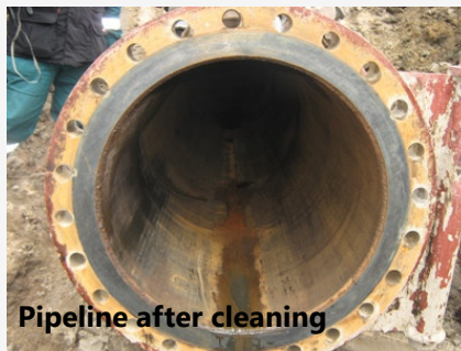
Pipeline after cleaning